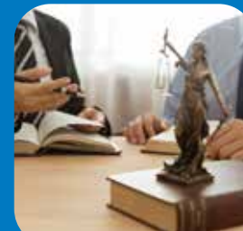
Law & Government

For students who enjoy problem solving and teamwork, this program offers a broad overview of engineering disciplines such as bioengineering, chemical, electrical, mechanical, industrial, aerospace, computer engineering and computer science. At the Watson School of Engineering and Applied Science at Binghamton University, students get a campus experience and learn directly from professors and other engineering students about degree programs and campus life. Visit locations also include the Innovative Technologies Complex, which provides a glimpse of cutting-edge research. Through job shadowing at Lockheed Martin and BAE, students get an in-depth view of engineering, providing insight into the various engineering areas while networking with a diverse group of engineers. Students work on a technical project with early career engineers to learn the "engineering life cycle" from start to finish. Participation in the SUNY Broome Robotics Challenge is also part of the spring semester.